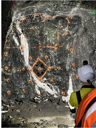
Photo 4 Pantoro OK underground