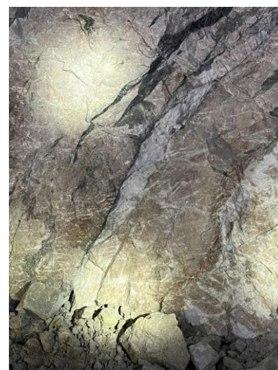
Photo 3 RED5 extension veins granodiorite

At Norseman the ability to consolidate ownership of the historical gold mine enabled the resources to be combined into a strong business case for a new mill, especially at today's gold prices along with applying modern geological exploration methods to uncover and expand the already known resources and convert them into reserves.