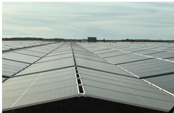
Photo 6 Bellevue solar farm

From an ESG perspective, safety was the number one focus of all management teams onsite. In addition, all mines have utilised existing infrastructure such as roads, tailings dams, camps and office buildings to reduce their impacts. The Bellevue and King of the Hills mines are operating combined, renewable & thermal back up power to assist in reducing their carbon emissions; while Pantoro's Norseman operation is conducting a feasibility study to do the same. In addition, all sites are endeavouring to increase their indigenous employment and contractor engagement, wherever possible.