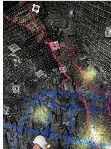
Photo 5 Karora Beta Hunt nickel load

From an ESG perspective, safety was the number one focus of all management teams onsite. In addition, all mines have utilised existing infrastructure such as roads, tailings dams, camps and office buildings to reduce their impacts. The Bellevue and King of the Hills mines are operating combined, renewable & thermal back up power to assist in reducing their carbon emissions; while Pantoro's Norseman operation is conducting a feasibility study to do the same. In addition, all sites are endeavouring to increase their indigenous employment and contractor engagement, wherever possible.