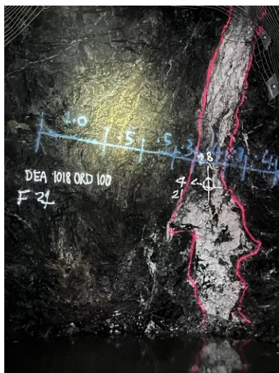
Photo 1 Bellevue Deacon Load

Of particular interest is the new plants at Bellevue, King of the Hills and Norseman have been built because the new geological exploration models identified significant reserves & resources that the previous miners ignored or missed. In the case of Bellevue, the key discovery was the significant displacement from a known thrust fault, which halted previous mining. At King of the Hills, it was recognition of mineralisation associated with extension veins perpendicular to the main quartz load which was not assayed by previous owners.